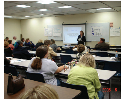
The Community Strategies workshop at the Building Bridges Forum