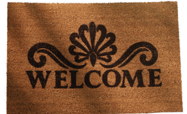
Put out the welcome mat for the new JPO Officers!