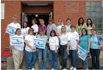
The staff of the Crime Victims Center and Fayette County Children and Youth Services

(724) 430-1223 ext. 423 or e-mail at mlukac@fayettepa.org